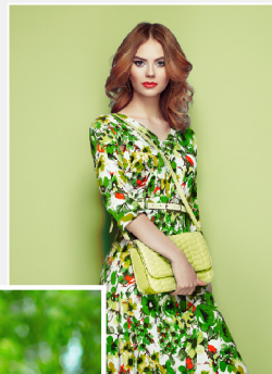
dresses for ladies